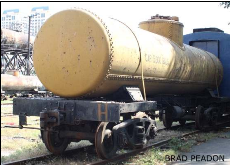
TF Tank Car