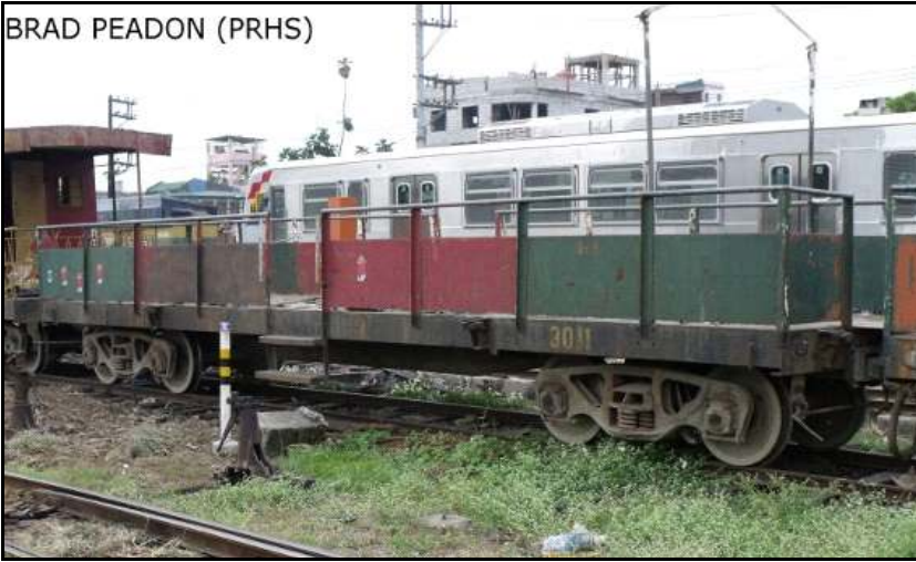
BRAD PEADON (PRHS)