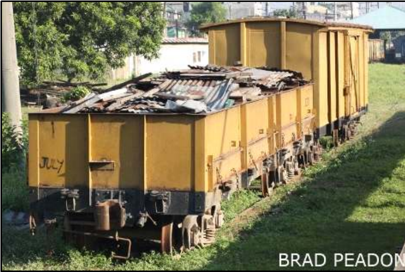
GC Open Wagon