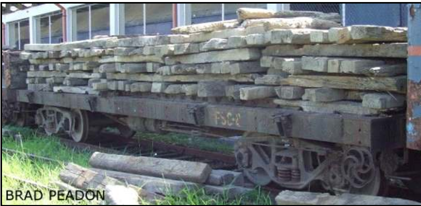
FL Flat wagon