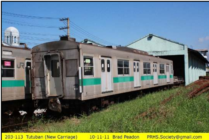
203-113 Tutuban (New Carriage) 10-11-11