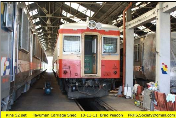
Kiha 52 set Tayuman Carriage Shed 10-11-11

A few cars were noted out of service in November 2011, the most notable due to a collision with a Coca Cola truck that saw the power units cab destroyed. This unit was awaiting a new cab.