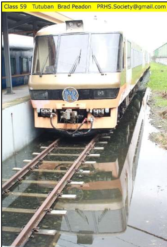
Class 59 Tutuban

It is believed that this will become the latest generation of inspection train, available for that and hiring usage.