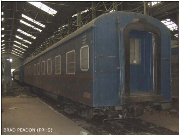
BRAD PEADON (PRHS)