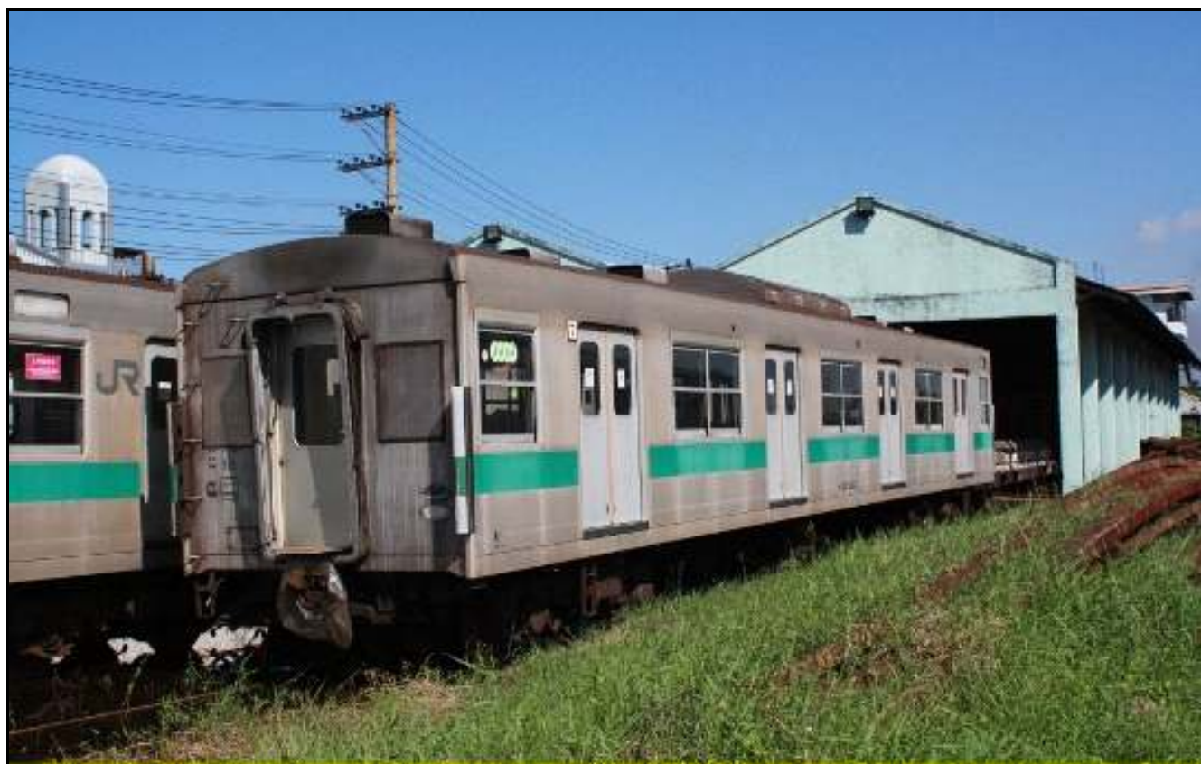
203-113 Tutuban (New Carriage) 10-11-11