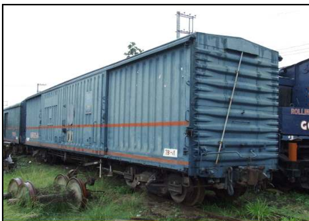
7B-41 Tayuman Yard 2009