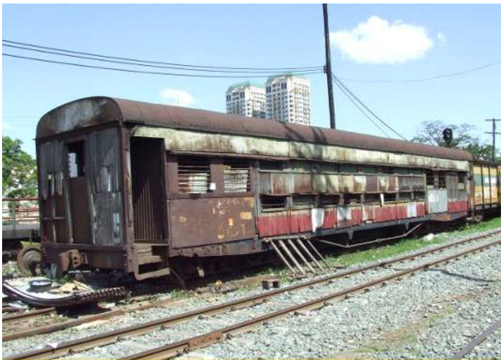
Dormitory Car 2009