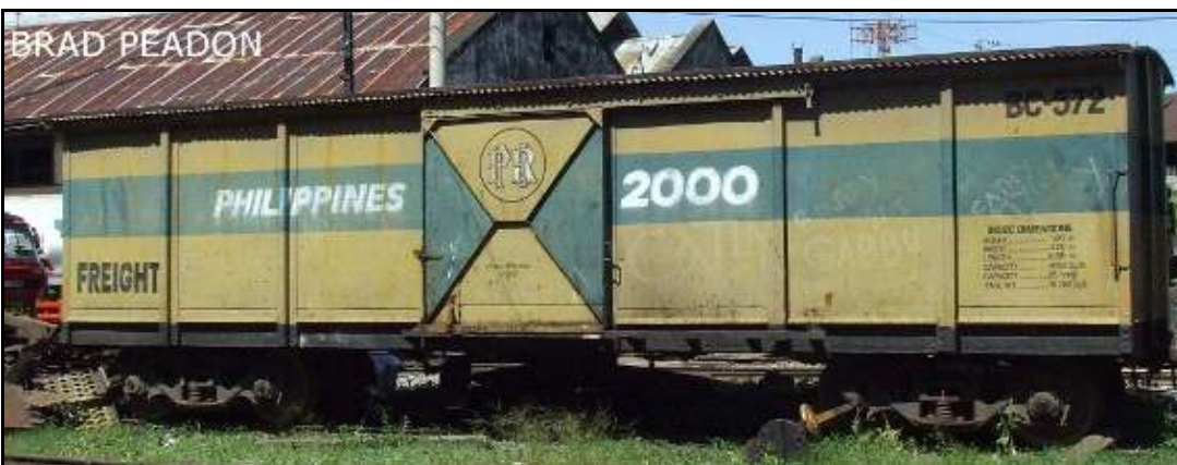
BC Box car