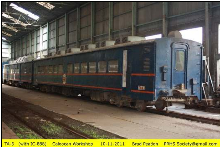
TA-5 (with IC-888) Caloocan Workshop 10-11-2011